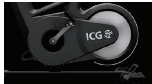
FULL COVER SHROUD AND POLY-V BELT DRIVETRAIN SYSTEM FOR SUPER SILENT RIDING