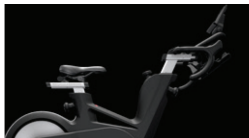
SUPERIOR 4-WAY ADJUSTMENTS ENSURE A FINELY TUNED FIT FOR ALL RIDERS