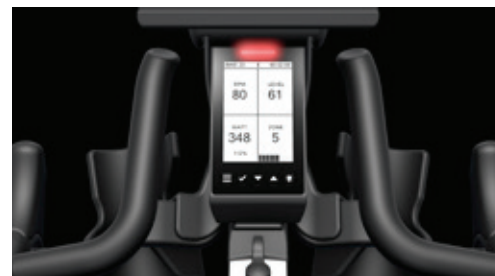
WATTRATE® LCD COMPUTER WITH COACH BY COLOR® AND CONNECT TECHNOLOGY