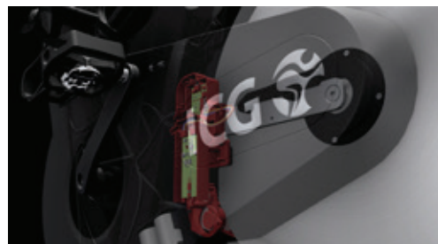
WATTRATE® POWER METER TO DISPLAY THE EFFORT IN WATTS WITH A HIGH ACCURACY