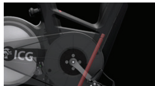
INTEGRATED HANDLEBAR USER ASSIST SYSTEM TO ENSURE AN EASY BIKE SETUP