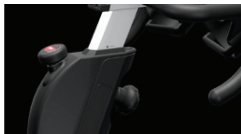
MAINTENANCE FREE MAGNETIC BRAKE SYSTEM WITH 300-DEGREE RESISTANCE DIAL