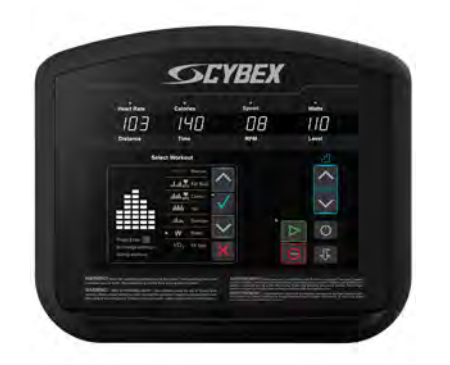
V Series Console

An intuitive total-body, low-impact workout that appeals to a wide range of exercisers. Stationary and moving handles offer added user versatility.