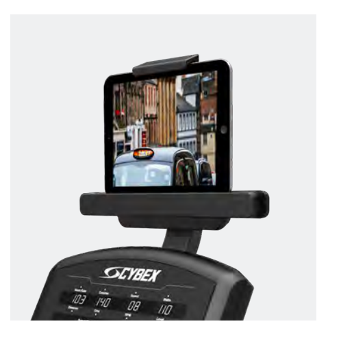
A secure tablet holder allows a facility to mount their own tablets, which lock in place, or lets exercisers bring their own and secure them during workouts.