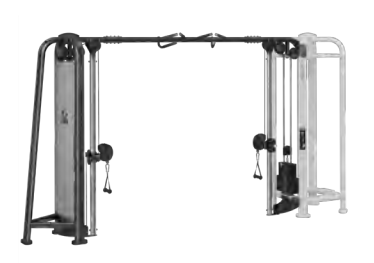
ATTACHED CABLE CROSSOVER