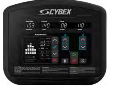
V Series Console

Entertainment options for 50L consoles and V Series consoles include a vivid 1080p attachable 15" HD TV and a secure tablet holder.