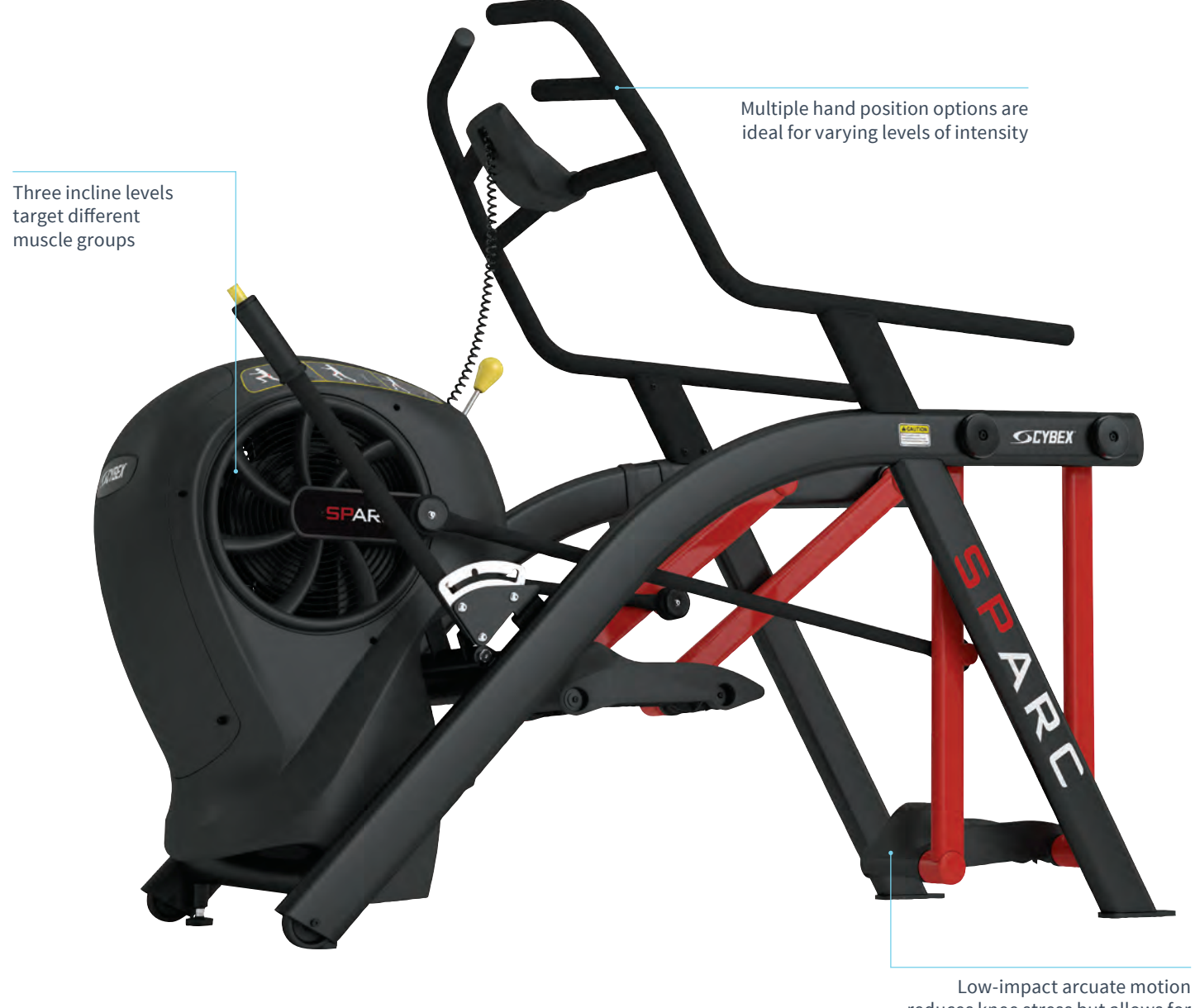
reduces knee stress but allows for high-intensity workouts

Two modes of operation include circuit mode for single, high-power movements that typically last less than one minute, and interval mode for longer duration workouts with user-defined high intensity and rest periods.