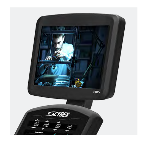
A vivid attachable HD 1080p TV 15" screen features an anti-glare coating and provides premium entertainment for exercisers.