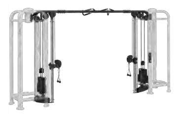
EMBEDDED CABLE CROSSOVER

• Carriage adjusts from 7-76" above the floor