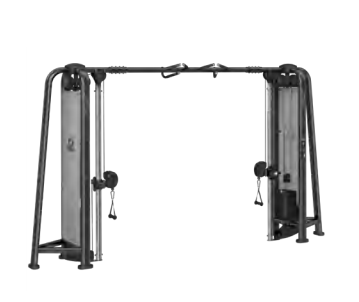
FREE STANDING CABLE CROSSOVER