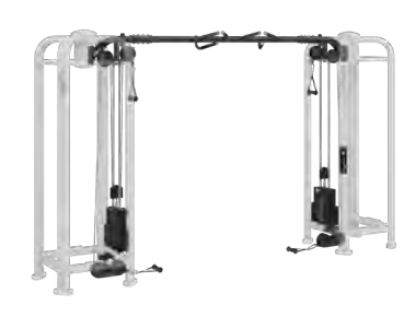
EMBEDDED HIGH LOW CROSSOVER