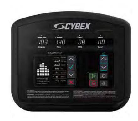
V Series Console

Availability varies by country. Please contact your representative for more information.