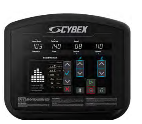
V Series Console