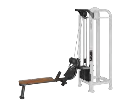
DUAL HANDLE LOW ROW